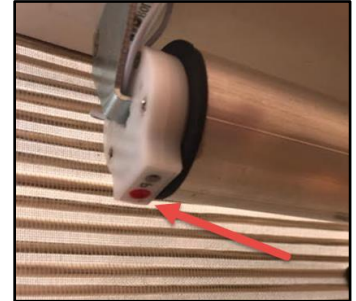
Reset Button – Natural Woven