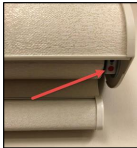
Reset Button – Shading/Dual