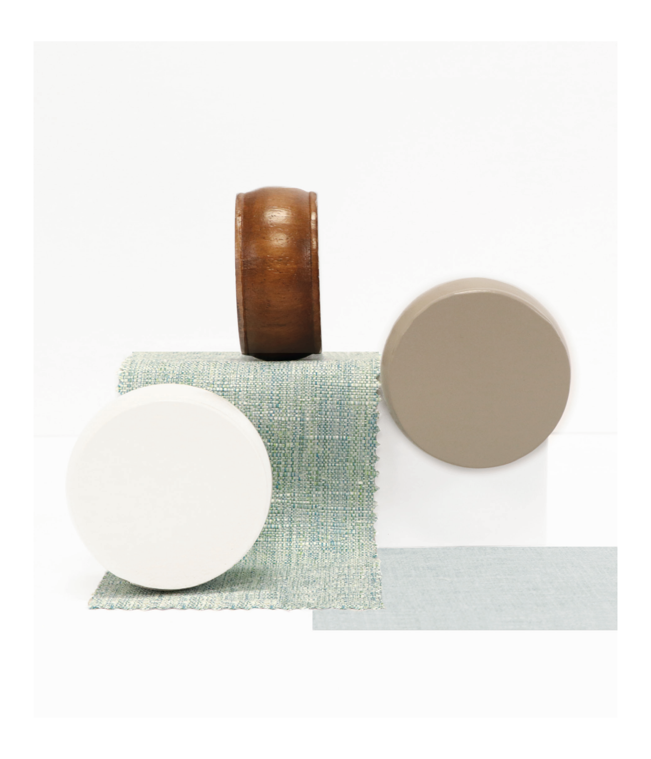
ENDCAP Estate Oak, Truffle, White shown. Available in: 1¾", 2", 3". Available in all colors.