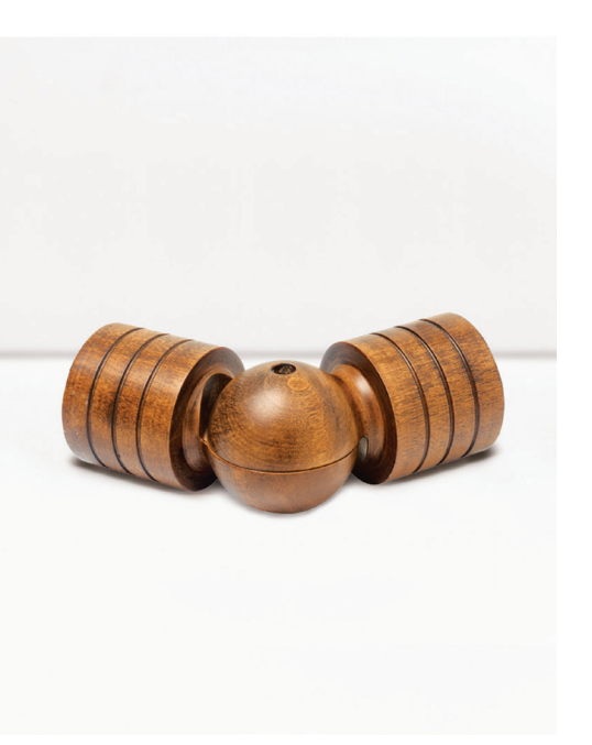
SWIVEL SOCKET Estate Oak shown. Available in: 1%", 2", 3". Available in all colors.