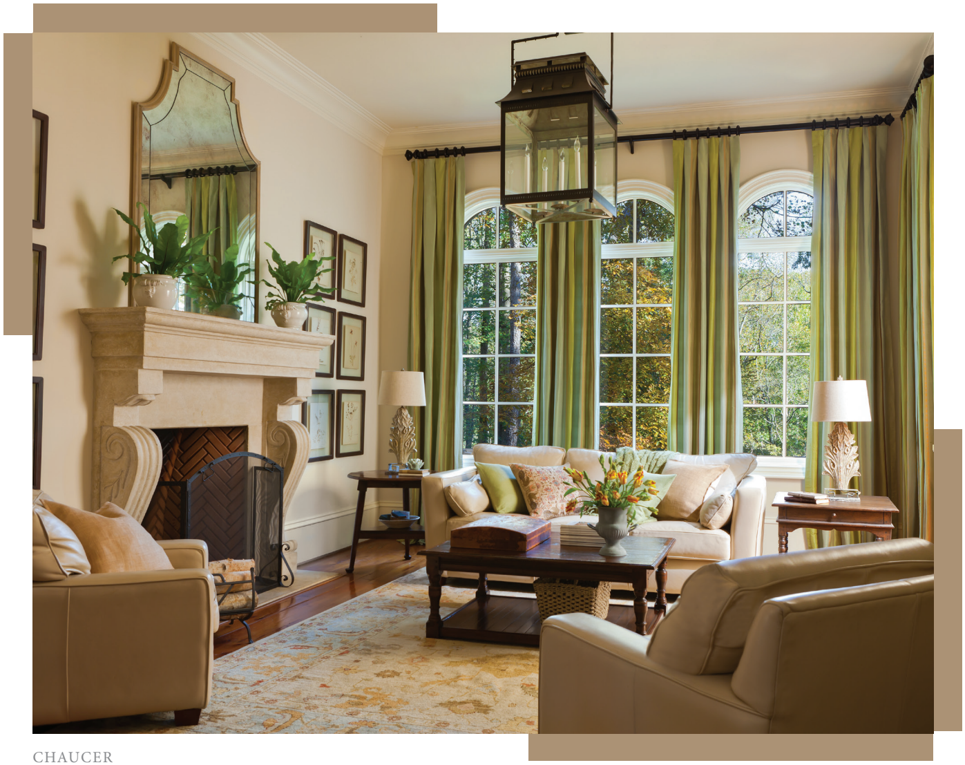
Dark Chocolate shown