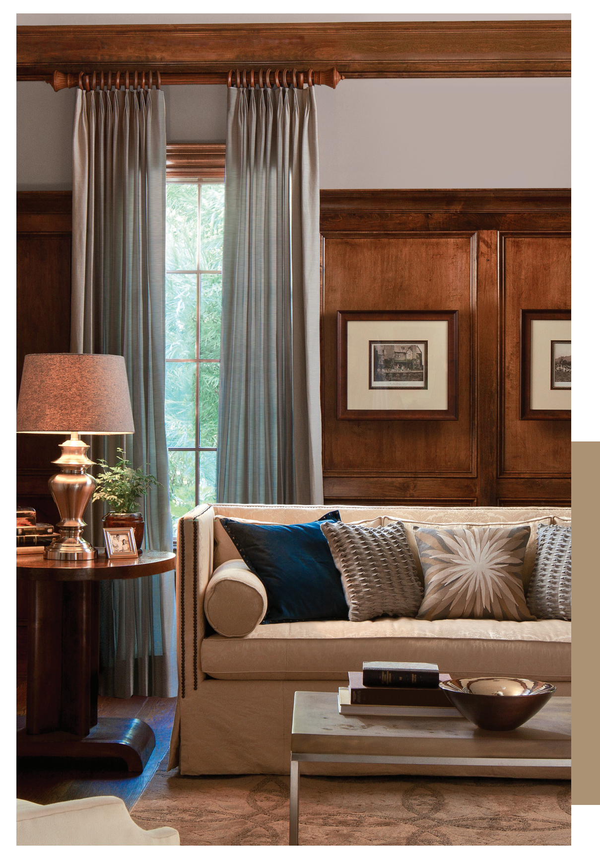
CHARLESTON Estate Oak shown