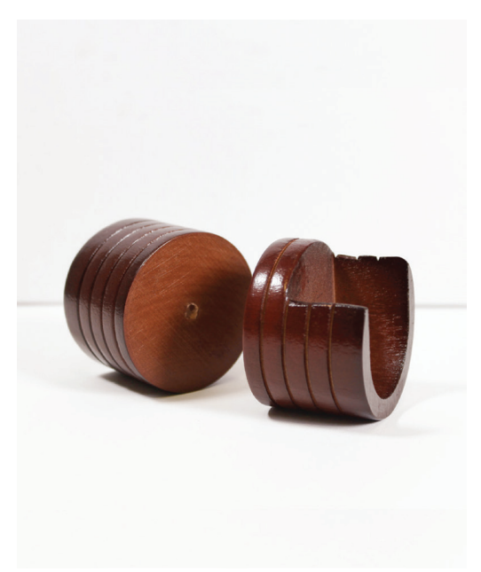
INSIDE MOUNT SOCKET Mahogany shown. Available in: 1%". Available in all colors.