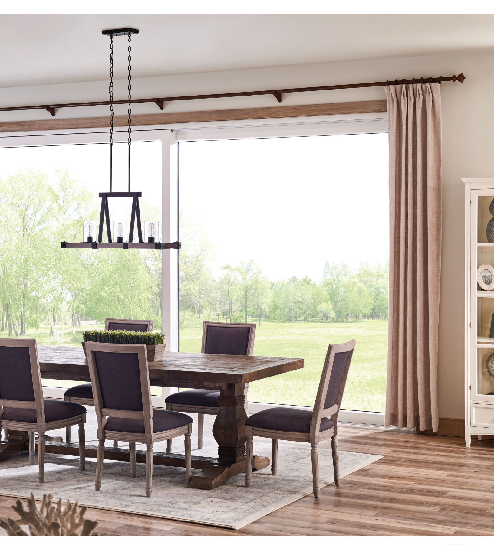
CHAUCER Estate Oak shown