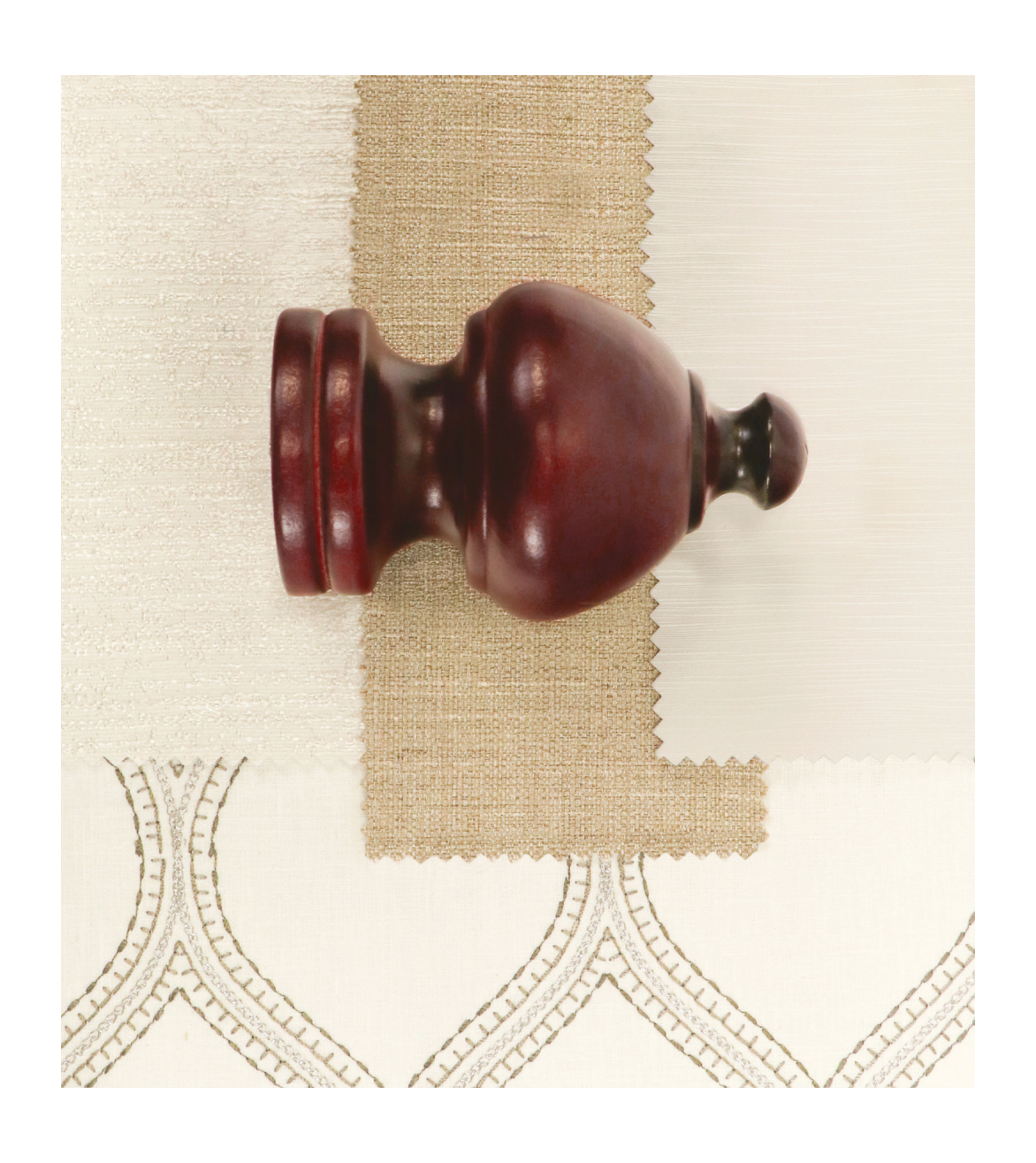
SHERWOOD Mahogany shown. Available in: 1¾", 2". Available in all colors.